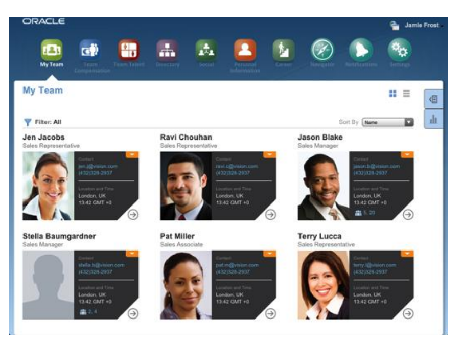
Figure 2 - Simplified User Experience - My Team

Managers and Employees are provided with a simple, modern, productive and intuitive self-service that allows them to move seamlessly from navigation to action in two to three taps or clicks on their device of choice. This allows for workers, who interact less frequently with Human Resource processes, to quickly complete tasks and understand the impacts of those tasks through embedded analytics from a single place.