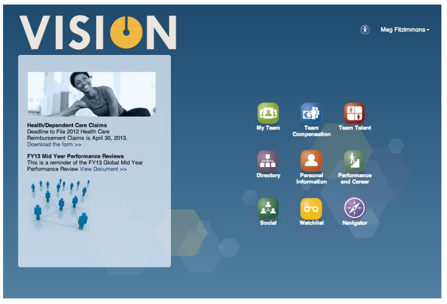
Figure 1 – Simplified User Experience – Landing Page

Oracle Fusion Human Capital Management goes beyond traditional HR tasks with strategies that balance people, process and technology to improve workforce efficiency, effectiveness, and productivity. Built from the ground-up for the Cloud or On Premise, on the device of choice, and to provide simple self-service capabilities that give users relevant, secure content to information they need. Global processes, interactive organizational charts, collaborative tools, predictive analytics, and productive self-service are natively delivered out-of-the-box to enable a rapid deployment of critical HR functionality.